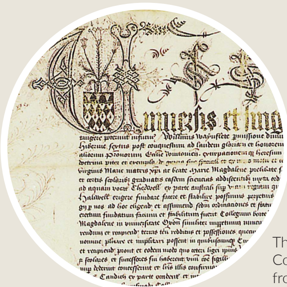
The Magdalen College Charter from 1458

We hope that members are inspired to become more actively involved in College life and will continue the tradition of philanthropy on which Magdalen has been built since its foundation in 1458.