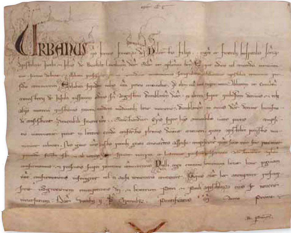
(above) Papal Bull (left) detail front of seal; (below) detail back of seal

In December 2002, the Oxford Conservation Consortium (OCC) embarked on a long-term project to clean and rehouse Magdalen's collection of 12,000 medieval property deeds. The deeds are still stored in their original 15 th century oak boxes, in 15 th century purpose-built cupboards in the Muniment Tower, and are among the most frequently consulted documents in Magdalen's archive. Once cleaned, the deeds are rehoused in acid-free envelopes, and, where possible, placed back inside their original boxes. Apart from their obvious historical value, the deeds are beautiful objects in themselves, and include some fine examples illustrating the development of charter diplomatic over some 500 years.